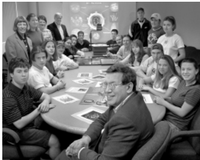
Smithtown High School science students visiting the PDB.