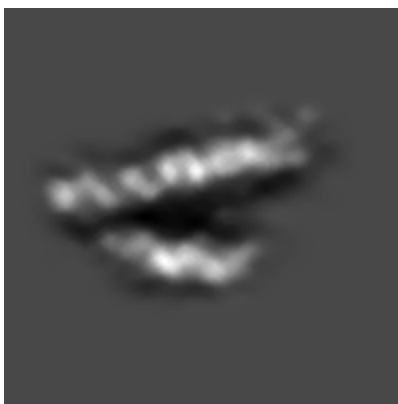
Y Index: 64